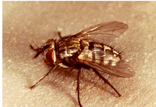
Tachinid parasite adults