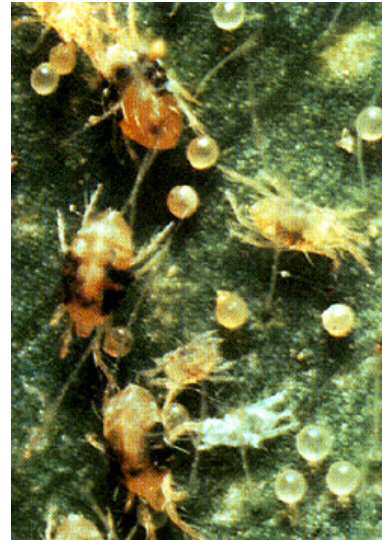
Spider mite colony and eggs

Overhead sprinkler irrigation may dislodge spider mites thereby reducing populations. Since potatoes are grown under optimum conditions, serious problems are not common unless the plants come