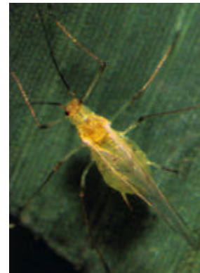
Winged form of the potato aphid