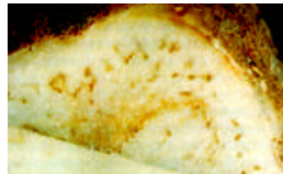
Potato leafroll infection and net necrosis in tuber