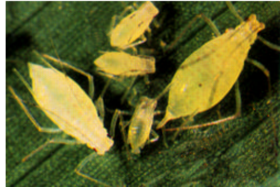
Wingless forms of the potato aphid

Control of the potato aphid is seldom necessary in commercial potato fields. Control may be necessary in potato seed growing areas to reduce the transmission of viruses, especially virus Y. Generally, measures used to control green peach aphid also control potato aphid. If insecticides are used, care should be taken to select insecticides that have the least effect on natural predators and parasites.