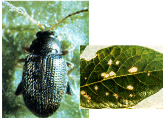
Flea beetle adult

Control of western potato flea beetle may not be necessary unless the population of adults exceeds 10 per 50 sweeps or unless the foliage shows severe feeding injury. For tuber flea beetle, treatment may be necessary when the adult population averages two or three per 7.6 m of row (25 ft). In June or July, five or six adults per 25 sweeps will cause economic loss. Treatment of the foliage with registered insecticides provides control of adult beetles. Application around the border of the field may be adequate to prevent