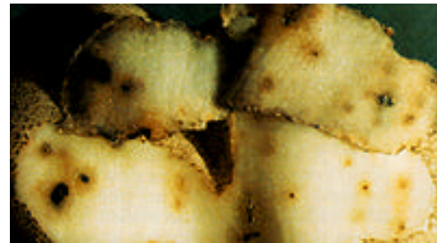
Larval feeding injury