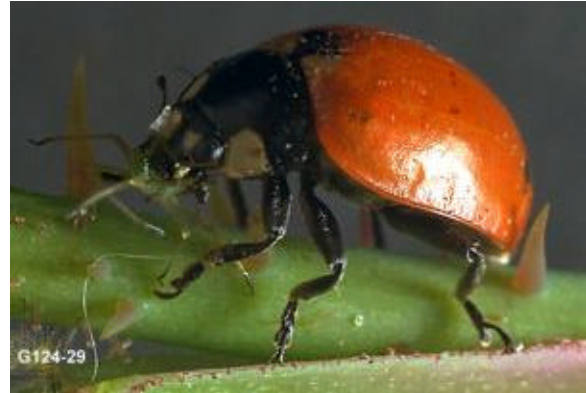
Lady beetle adult

H. quinquesignata larvae consume an average of 245 ± 39 aphids in 11 days; adults consume an average of 336 ± 8 aphids in 31 days.