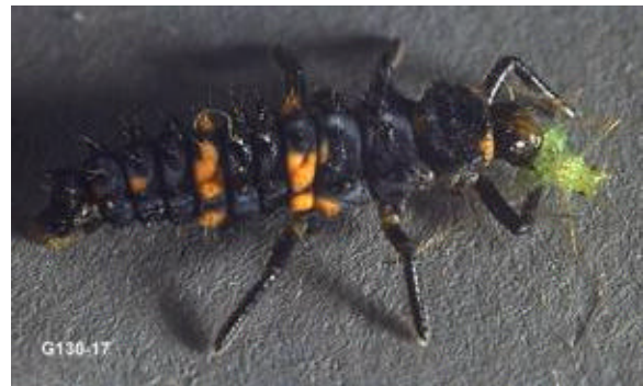
Lady beetle larva